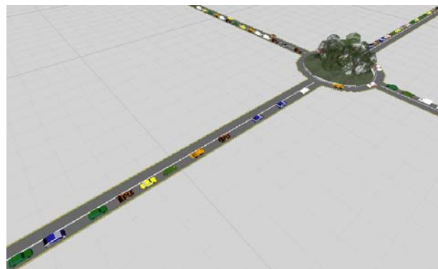
Figure 4: 3D view of the modelled roundabout.