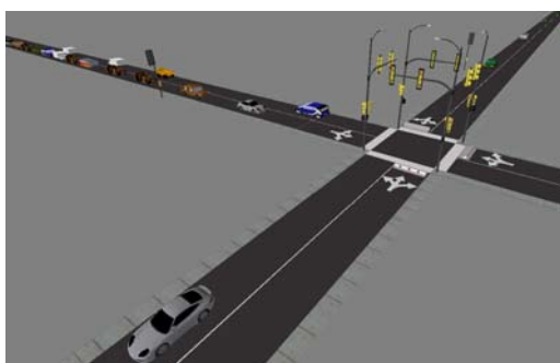
Figure 3: 3D view of the modelled signalized intersection.

To model roundabouts, in Simio, it is possible to add models to a project, using the elements of other models of this project. Thus, in this case, a new model was added to this project, which uses most of the processes that already existed. Thereafter, we only needed to change the design of the intersection and model the rules to access the roundabout. This was of particular importance, since it allowed the modelers to use the same elements in all intersections that would later be compared. For instance, all vehicles in all intersections use the same processes to slowdown or accelerate. Figure 3 and Figure 4 respectively show the simulation models of signalized intersections and roundabouts during runtime.