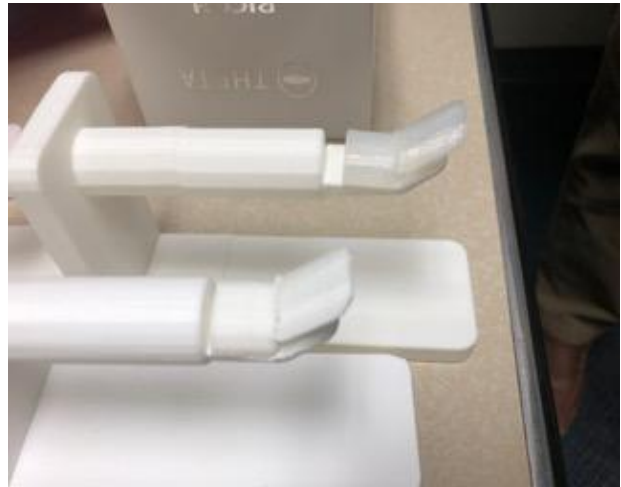
Figure 4. 3D printed onychectomy trainer

on the device are not properly distributed across the skin, the brace can result in irritation, bruising or rashes.