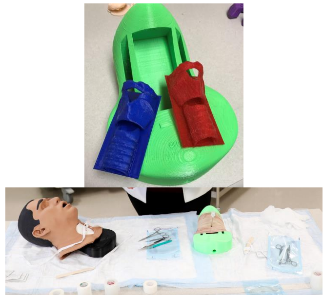
Figure 2. 3D printed cricothyrotomy trainer

Figure 2 is a photograph of the 3D printed cricothyrotomy trainer. Three prototype 3D units were printed until the nurses found a unit with a good strength and texture. The housing unit was printed using a PLA filament. The insert was printed with TPU for flexibility. Eight units were produced in 2018 at a cost savings of $4000 and are still in use. The units are providing hands-on experience for students in flight nursing.