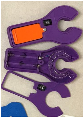
Figure 3. 3D printed vein finder

Figure 3 is a photograph of the 3D printed vein finder. The vein finder was printed using a PLA filament. This unit was the result of several high school internships collaborating with the College of Nursing and the SMAP center.