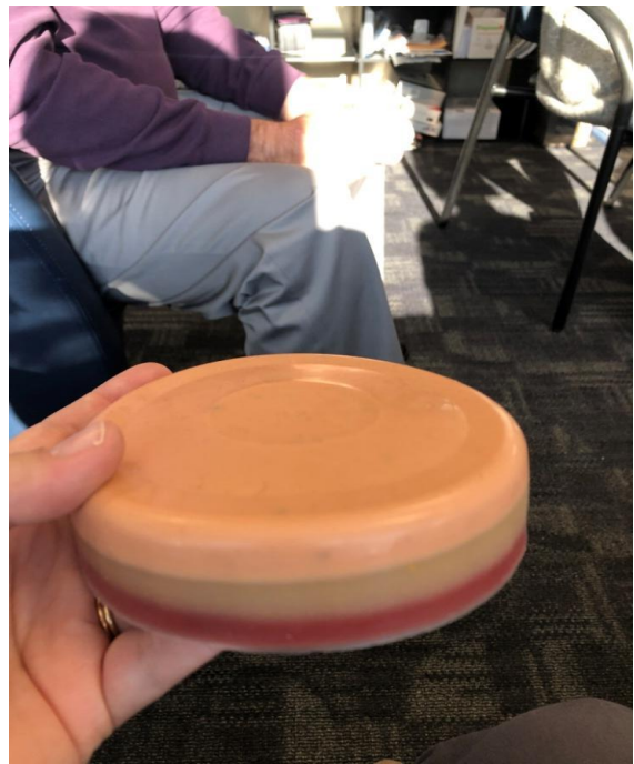
Figure 6. 3D printed injection pad trainer

muscle layer. The nursing faculty was actively involved in this process to represent the desired realism.