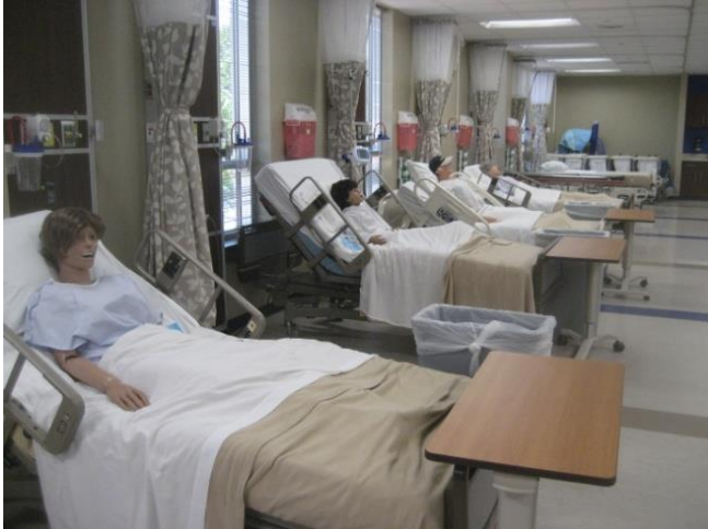
Figure 1. Teaching hospital

The UAH Learning & Technology Center has developed over one hundred simulation training scenarios. Each simulated clinical experience is documented in detail and placed in a three-ring binder with specific clinical objectives, a detailed set up sheet and picture for standardized repetition with multiple clinical groups. The 3D printed units presented in this paper have been integrated into clinical training scenarios.