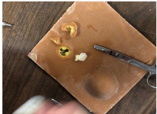
Figure 7. 3D printed suture pad trainer

The abscess is a raised area in the skin layer where an infection has developed. The students have to practice lancing and cleaning the abscess (the dishwasher pod). The students practice on stitching the wound when a tendon is involved and on avoiding the tendons when making an incision.