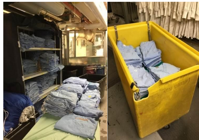
Figure 2. Uniform actual distribution system (self-service with limited control)