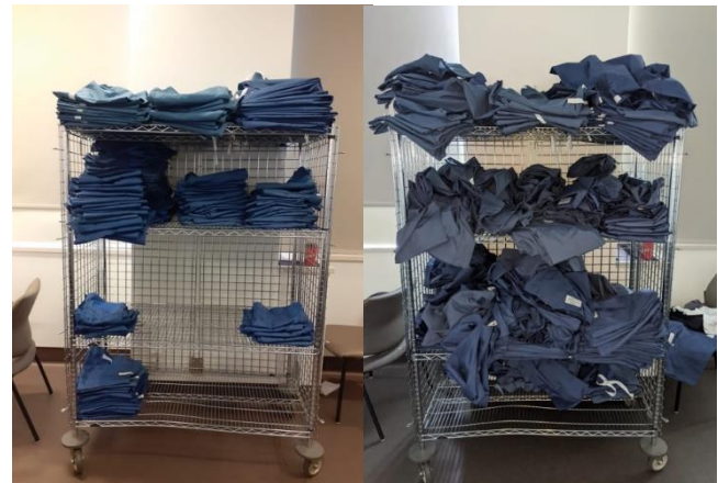
a) Shelf at the beginning of the day and b) Shelf at the end of the day

In Phase 5, in order to “observe how effective and efficient is the solution”, we intend to participate in a pilot project of one system (e.g., smart cabinet, smart shelves, or else) in the OR department of the hospital. The results of a real implementation will provide data against which we will revise the simulation model inputs and align it to make it more reliable for further deployments.