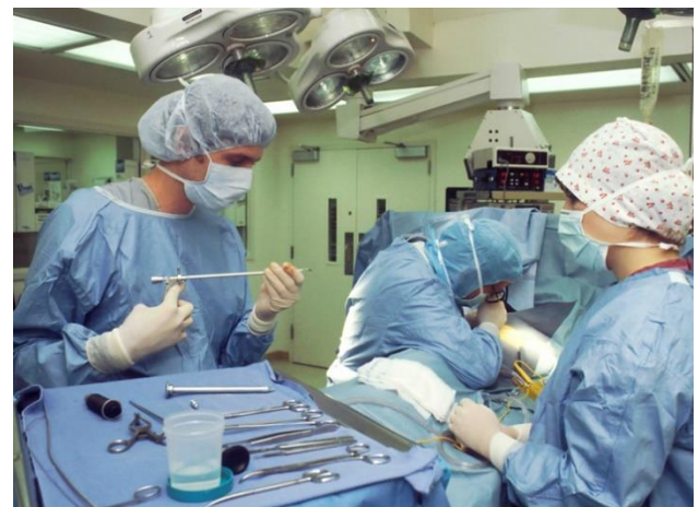
Figure 3. Uniform distribution system: from laundry to OR department for medical personnel.